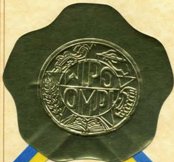
Kamil Idris Director General WIPO

A handwritten signature in black ink, appearing to read 'Kamil Idris', written over a white background.